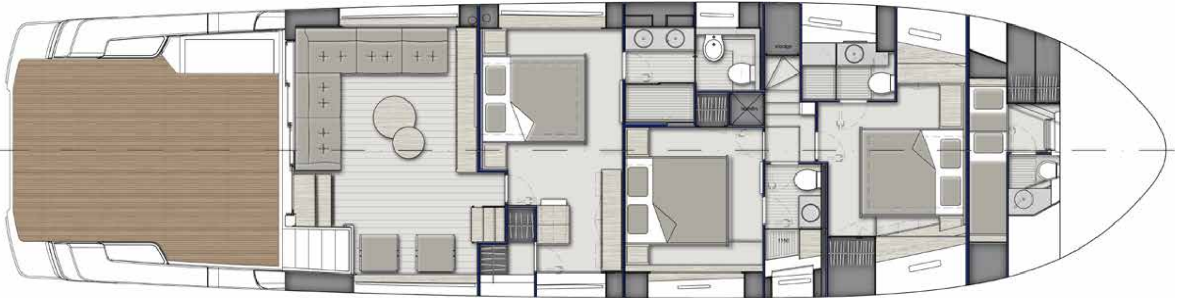
LOWER DECK B