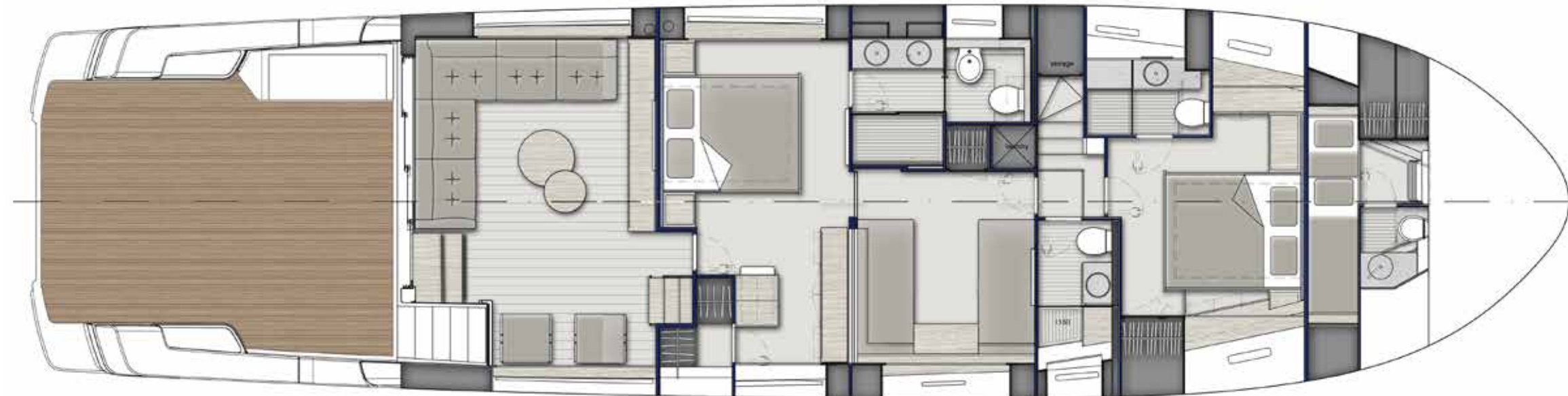
LOWER DECK A with twin beds configuration